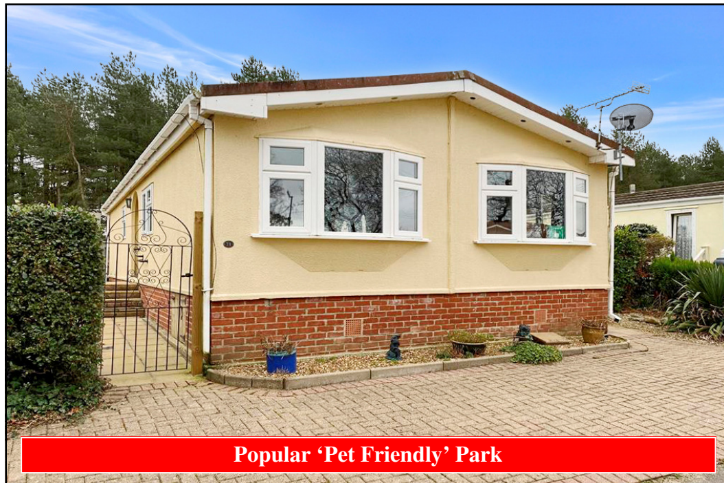
Popular 'Pet Friendly' Park

71 The Avenue, Oaktree Park, St Leonards, Ringwood. BH24 2RJ